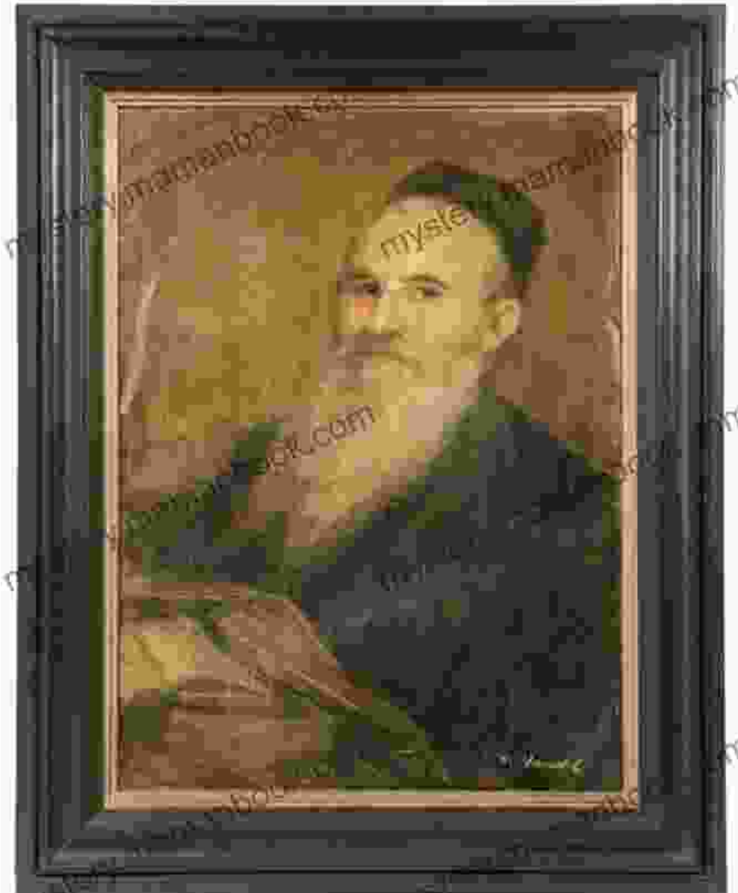
Rabbi Ben Ezra by Robert Browning: A portrait of an elderly rabbi

Browning's rabbi celebrates the resilience of the human spirit, urging us to find joy in the present moment and to cultivate meaningful relationships. He emphasizes the importance of surrounding ourselves with true companions who will support us through life's challenges and celebrate our triumphs.